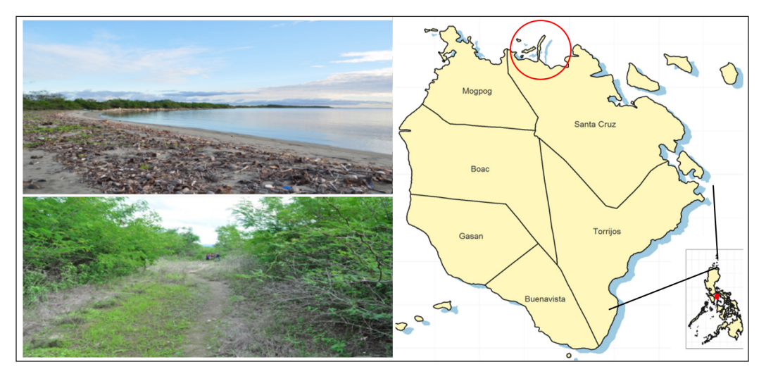
Figure 1. Map of Marinduque, its location (inset) and the study site (encircled red) (https://www.r-bloggers.com/creating-inset-map-with-ggplot2/)

Marinduque, an island province located 137 miles south of Manila is an ideal area to study heavy metals. The island located south of mainland Luzon only measures 172,700 hectares and is composed of six townships namely Boac, Gasan, Buenavista, Torrijos, Sta. Cruz, and Mogpog. In the municipality of Sta. Cruz, an eight-kilometer causeway was created from the mine tailings dumped in the vicinity of Barangay Ipil along Calancan Bay. The island province is also rich in biodiversity. In fact, seventy-five species of birds were observed in the island, of which, seventeen are endemic to the country and six are island endemic subspecies (Gonzalez & Dans, 2000). The possibility of detecting more species of birds in the said area is high as Sanchez (2015) captured some species that were not recorded in books such as by Kennedy et al. (2000).